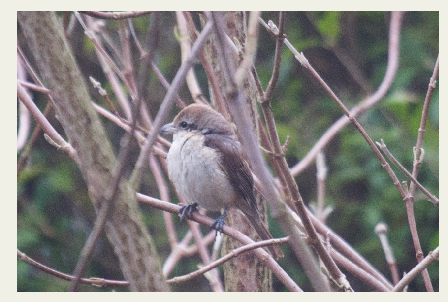
Brown Shrike - Holland Feb. 22<sup>nd</sup>