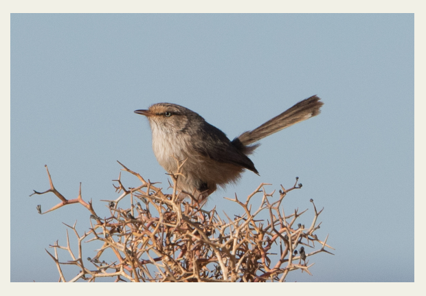
"Saharan Scrub Warbler"