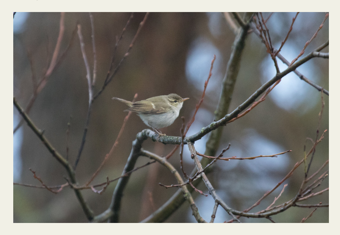
Two-Barred Warbler - Öland, Sweden Nov