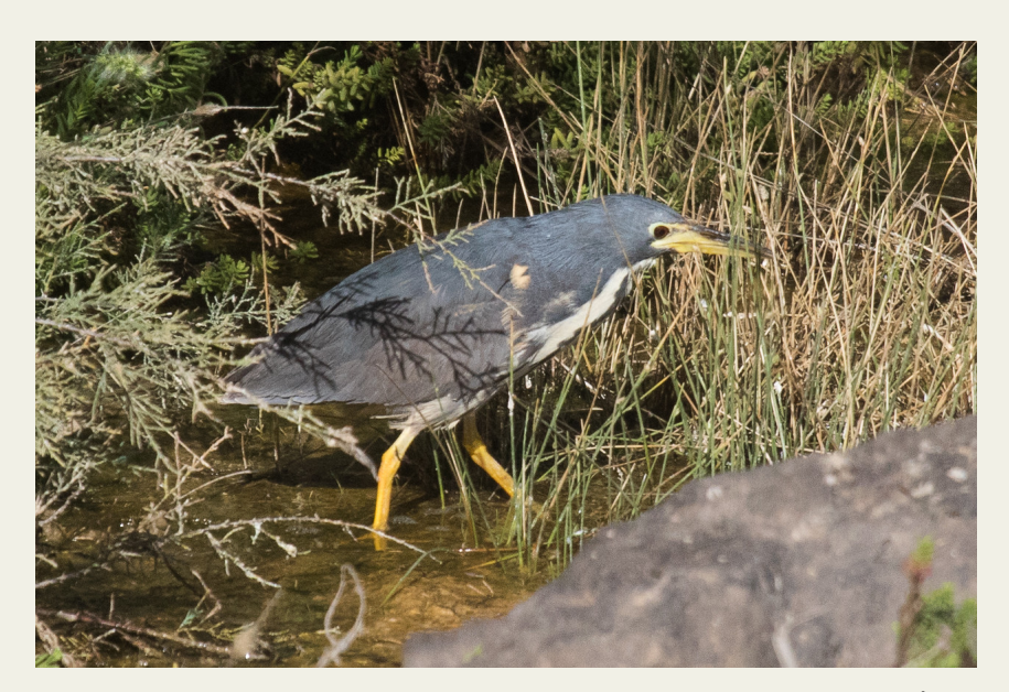
Dwarf Bittern – Fuerteventura Dec 2<sup>nd</sup>