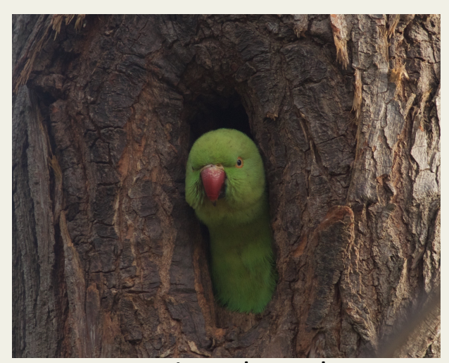
Rose Ringed Parakeet