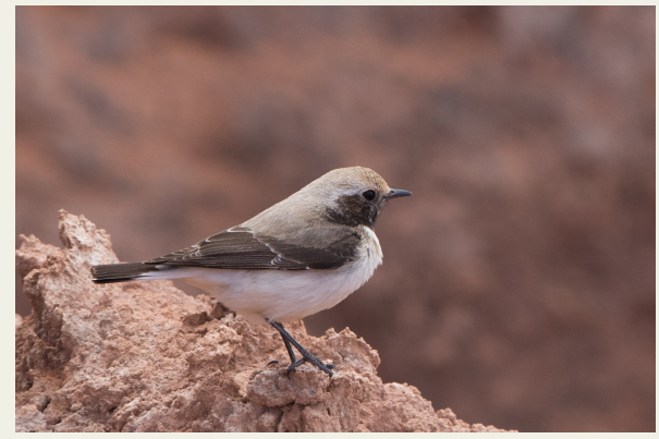
"Mahgreb Wheatear" Female