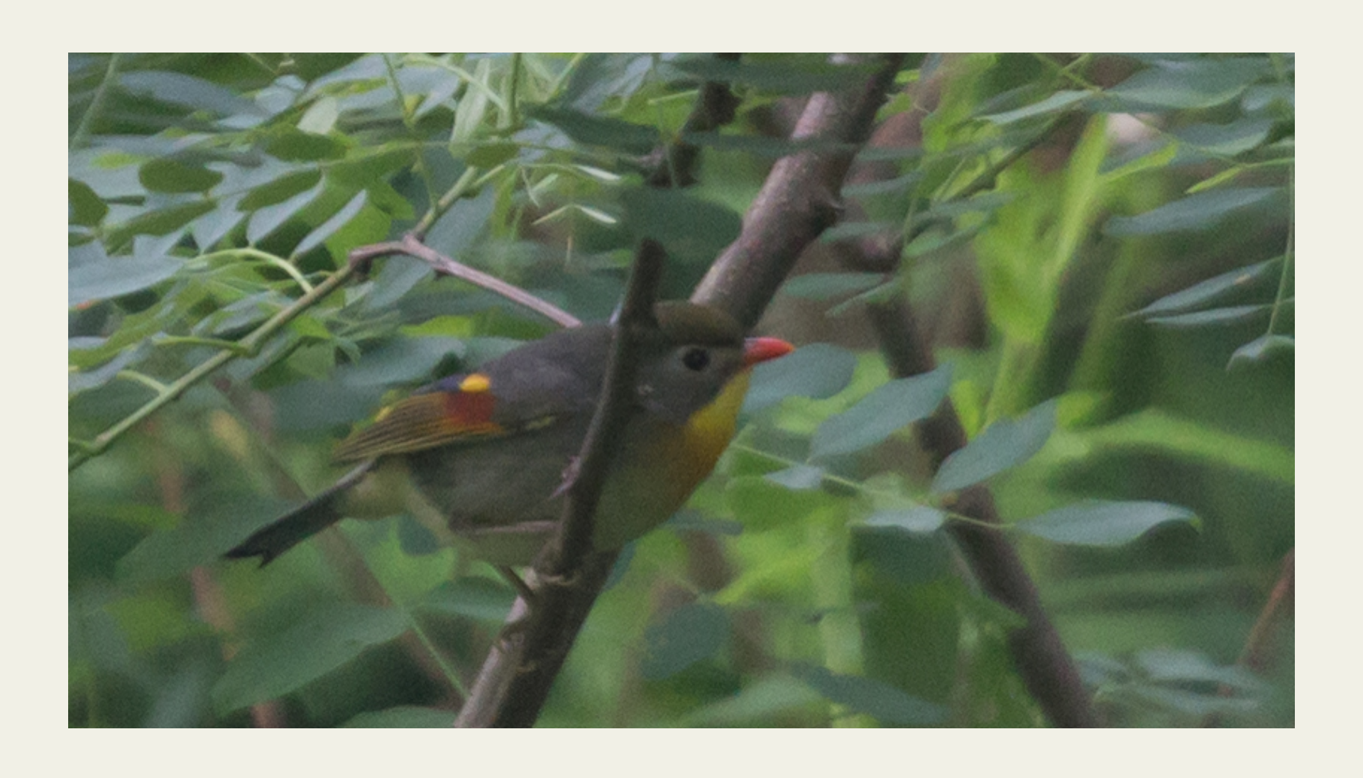
Red-Billed Leothrix – Italy June 3 2017