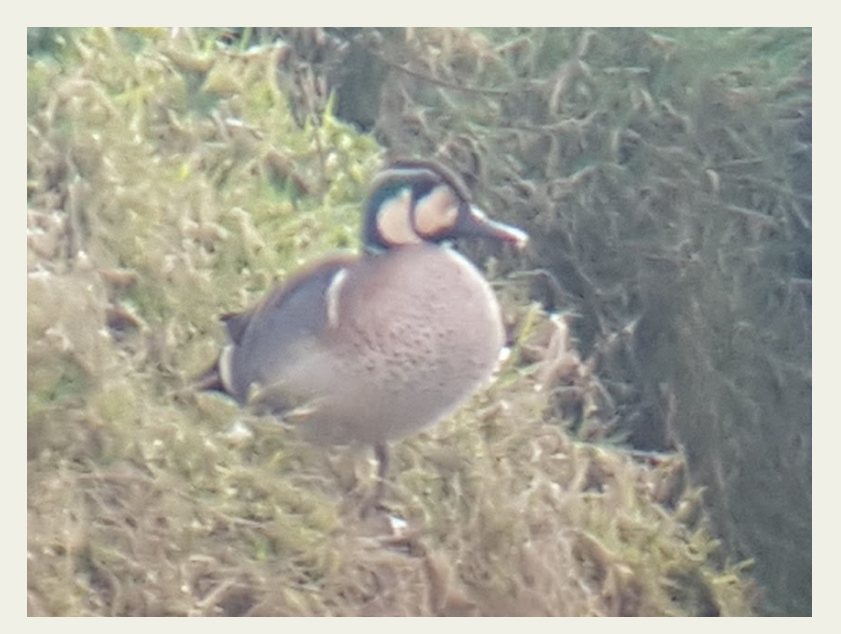
Baikal Teal - Holland March 22<sup>nd</sup>